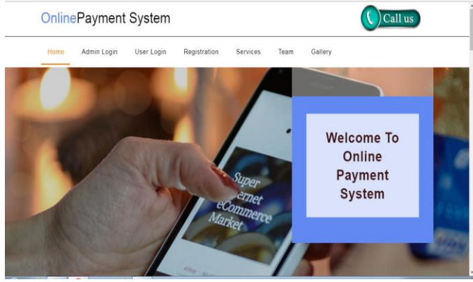
Figure 3. Online Payment System

Moreover, the unauthorized access monitored in the existing system is much higher than the proposed system. In the proposed system it can be minimized by more than 50%.