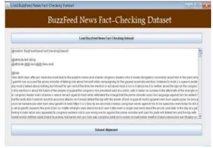
Figure 4: BuzzFeed News Fact-Checking Dataset