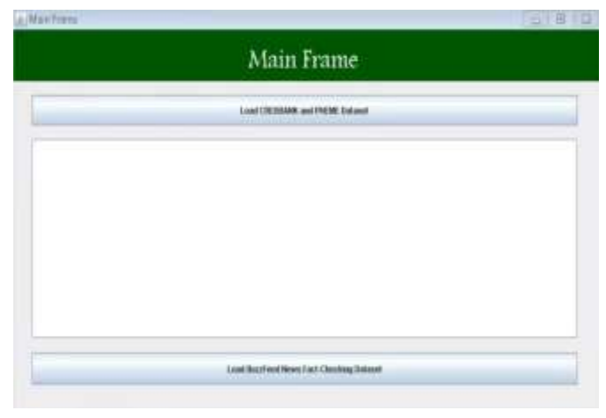
Figure 2: Home Page