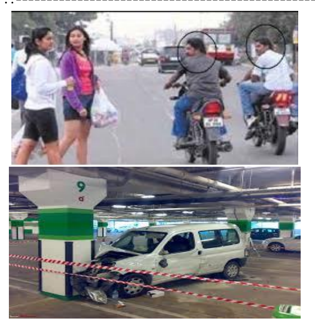
Accidents due to negligence

Because of growing industries here Transportation has become a requirement for delivering the goods and retaking it and also it is one of the major problems for where accident takes place in a hurry. Because of heavy overweighted load and fast driving tragedy is the major cause. All though there may be a lack of failure from Man Machine and Material but proper technology of braking and bumper activation can eliminate the accidents caused due to harsh driving and signal jump.